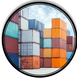
Full Container Loads