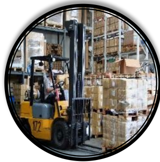
Less Than Container Loads